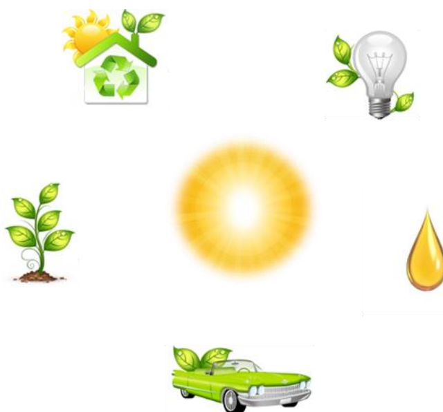
Figure: 'Sunlight into storable solar fuels'

Producing carbon-neutral clean fuels (such as hydrogen) and developing breakthrough energy storage chemicals will not only contribute to mitigating climate change, they will also serve to enhance energy